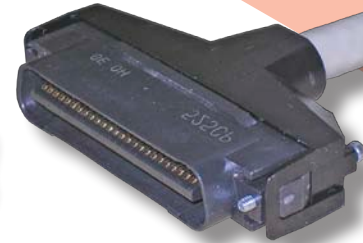
Female Connector 90° Hood