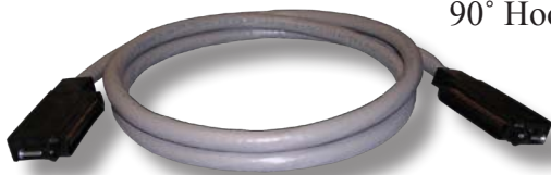
90° Hood Male to 90° Hood Male