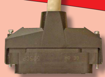
Male Connector 180° Hood