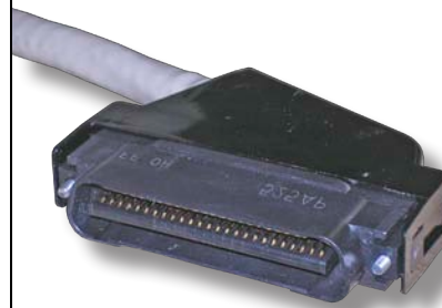
Male Connector 90° Hood