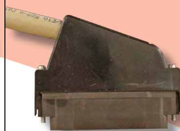
Male Connector 110° Hood

Cabling Excellence for Open Architecture